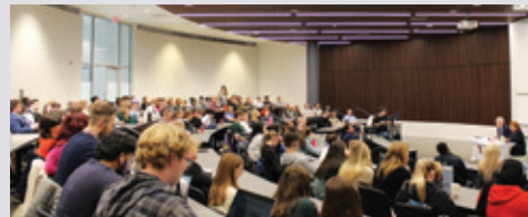
02.05.24 Civility in Polarized Times with Senators Heidi Heitkamp & Rob Portman