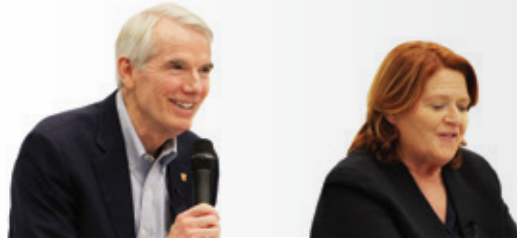
LEFT + BELOW: 'Civility in Polarized Times' event held February 5, 2024 featuring Senators Heidi Heitkamp and Rob Portman