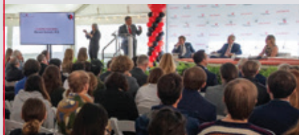
10.23.23 Opening Ceremony with Senators Kyrsten Sinema & Rob Portman