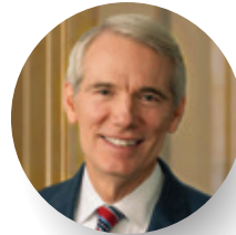
ROB PORTMAN Founder/Board Chair, Portman Center for Policy Solutions