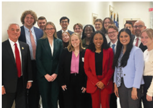
ABOVE: 2024 Fellowship Class visit Washington, DC and has meetings with Senator Brown, Representative Carey, Representative Landsman, and Representative Wenstrup

The Portman Center assists policymakers and organizations as they navigate the finding of these solutions.