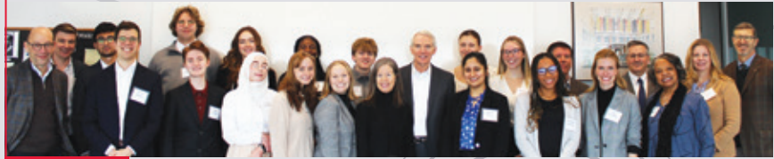
01.22.24 Board & Fellow Breakfast

From our grand opening event to our inaugural class of undergraduate fellows, we charted new territory and laid the groundwork to have an impact at the University, in the community, and across the country. While there are many exciting things to come, there will never be another first year.