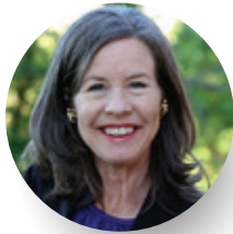
DENISE DRIEHAUS Commissioner Hamilton County